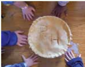
Providence Home Green Tomato Pie and the hands that made it.