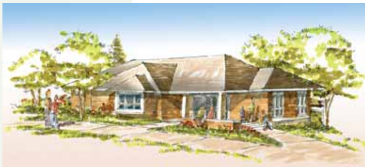
Architect’s rendering of Residential Services cottage

Intermountain, in partnership with the City of Helena, was recently awarded a Community Development Block Grant (CDBG) for $450,000. This federal funding will support the building of two new cottages on Intermountain’s Helena residential treatment campus. Thanks to the strategic partnership between Intermountain and the city – who sponsored the application – Intermountain was successful with its first CDBG public facilities proposal.