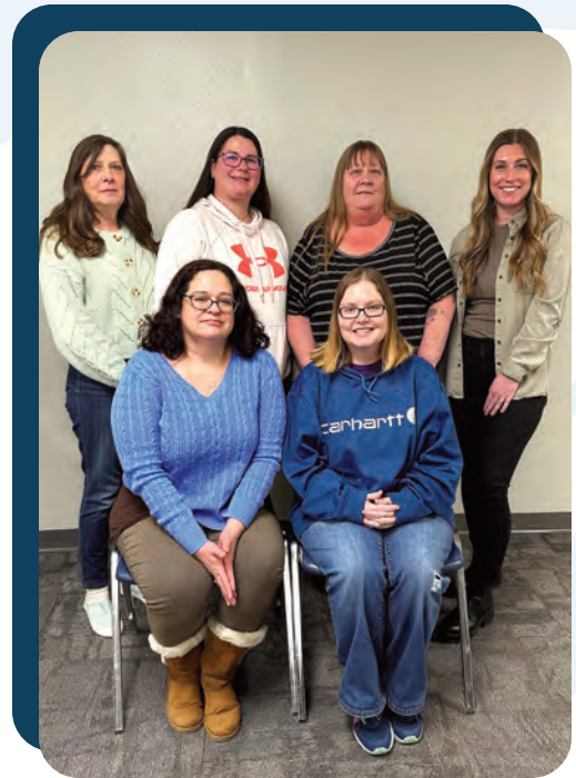
FSN Direct Care Staff

This year we added services to meet the growing needs of the adult populations in the communities we serve, including Helena, Bozeman, Billings, and the Flathead Valley.