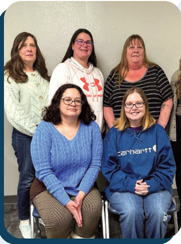
FSN Direct Care Staff